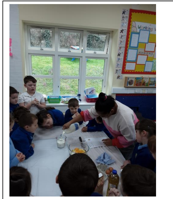
All children enjoyed making and eating Pancakes and adding their choice of topping.